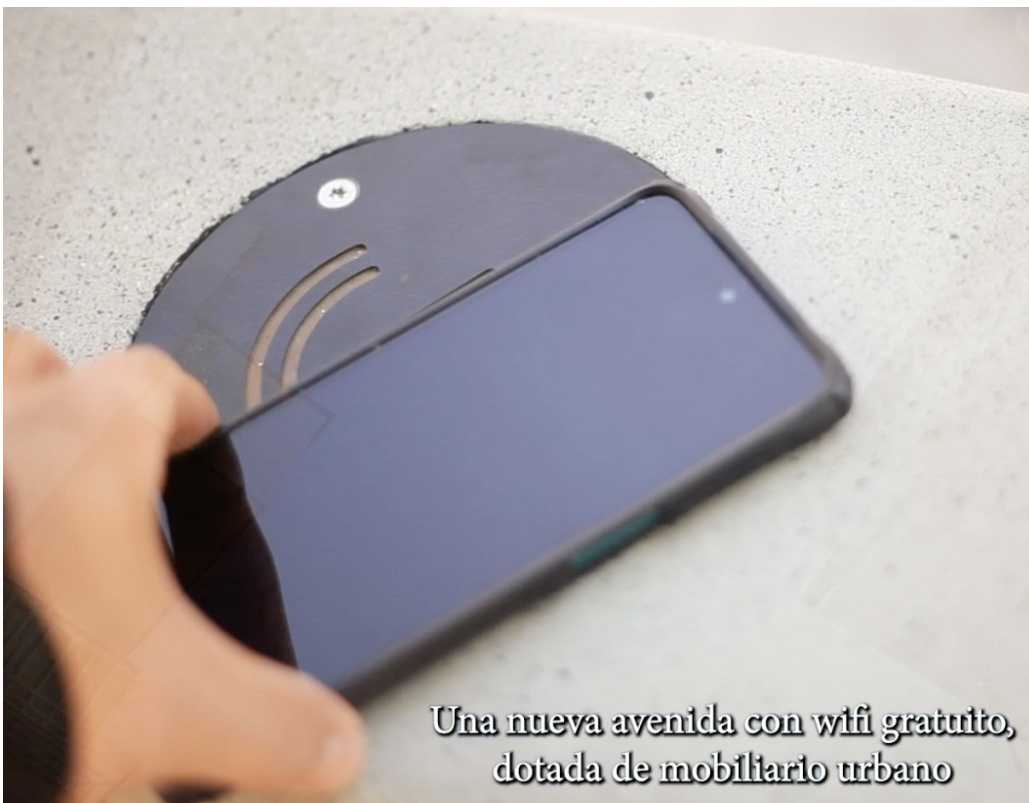
Una nueva avenida con wifi gratuito, dotada de mobiliario urbano

Other innovative factors of this street remodeling are the creation of several shaded rest areas, which can be used mainly by the elderly in a district with such an aging population as Centro, and the installation of street furniture with the capacity to wirelessly charge cell phones and tablets.